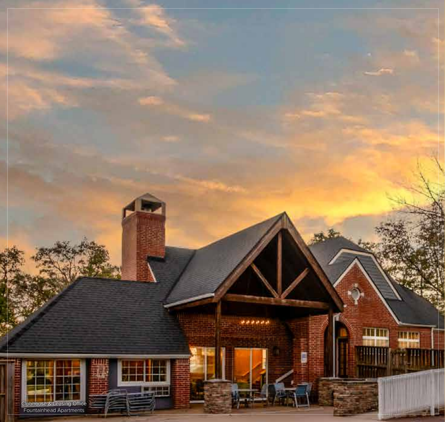
Clubhouse & Leasing Office Fountainhead Apartments