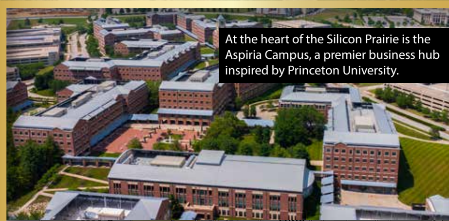
At the heart of the Silicon Prairie is the Aspiria Campus, a premier business hub inspired by Princeton University.