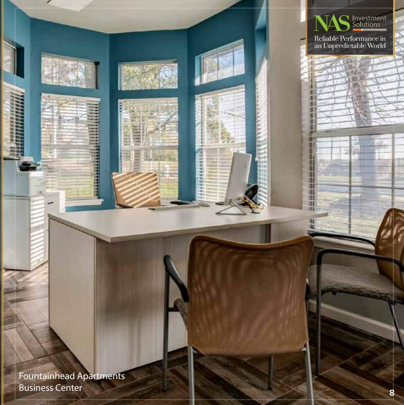
Fountainhead Apartments Business Center