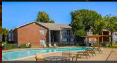
Willowpark Apartments Lawton, OK | Acquired Feb 2023