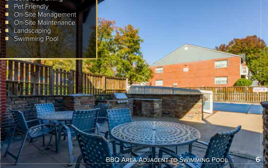
BBQ AREA ADJACENT TO SWIMMING POOL