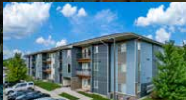
Broadway Apartments Des Moines, IA | Acquired Feb 2024