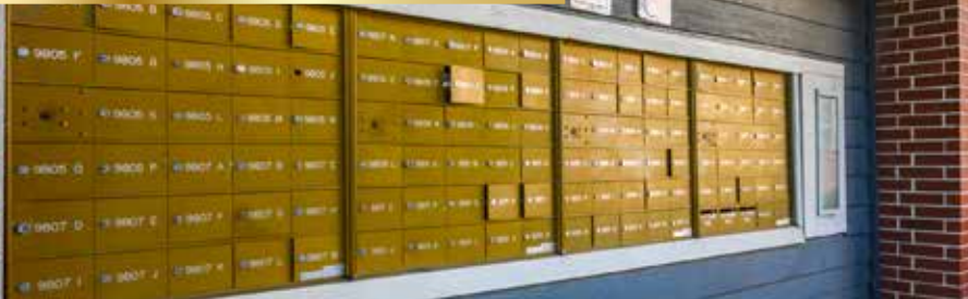
PACKAGE & MAIL CENTER