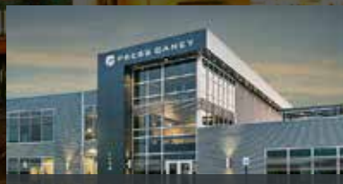
Single Tenant Office South Bend, IN | Acquired Dec 2021