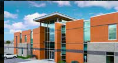
Single Tenant Industrial Office N. Syracuse, NY | Acquired June 2019